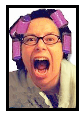
"Real funny, honey. Just really funny!"

I would like to share one idea today— an idea that will help couples reconnect. What is the ritual in your relationship when husbands, or wives, come home from work? In the field, we call these "greeting rituals." For couples with young children, a common greeting ritual is what I like to call the injury report or Paul Revere's last ride— where one spouse warns the other of all of the impending dangers the family is facing: bill collectors, over due books, broken appliances, and who got in trouble at school on that particular day. It could also become a "navigational report" as to what kids need to be where. Wives are good at mapping out strategic pick up locations